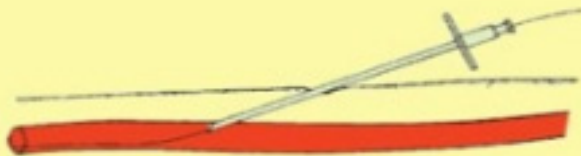
Step 3. Insertion of guide wire